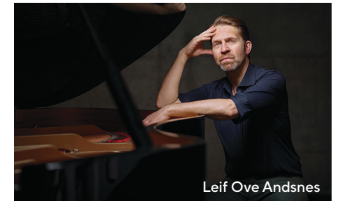
Leif Ove Andsnes

Dover Quartet with Leif Ove Andsnes | PIANO