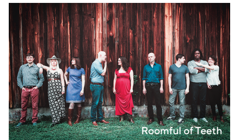
Roomful of Teeth

WEDNESDAY, JANUARY 24, 2024 | 7:30pm Herbst Theatre | $65/$55/$45